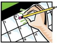
Change of Date

GLOW WILL BE MEETING TODAY, SUNDAY, APRIL 28 AT 10:00 A.M. (after worship) instead of May 5. Points of interest: new faucet for kitchen, Ice Cream Social at Mikkelson Manor on June 5, Shetek Lutheran Ministries Quilt Auction on June 22, Summer Bible study at