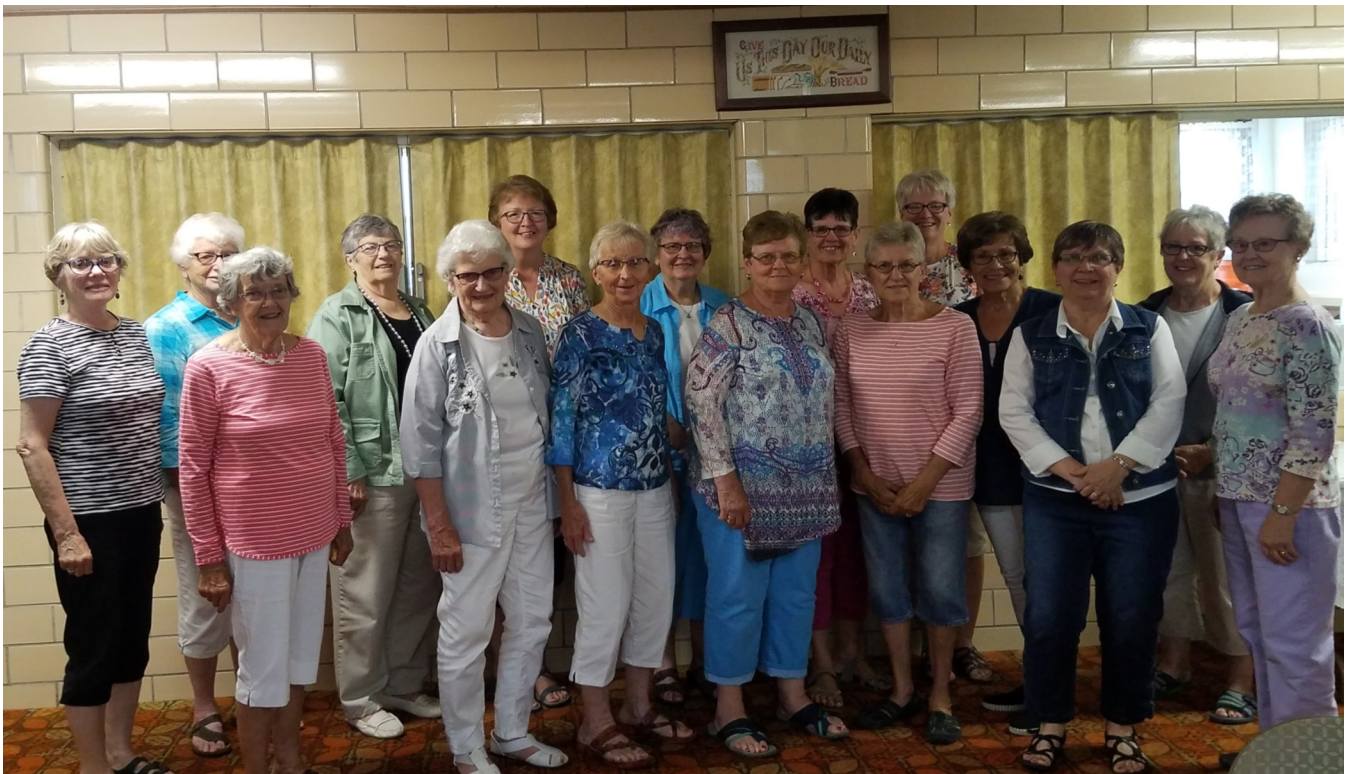
Women's Summer Bible Study at Bethany Lutheran Bergen.

Come for conversation, chips and salsa, a beverage (of your choosing). You may learn something, and it's sure to be a good time! (There may even be cards!)