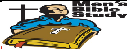
Men's Bible Study

Are you interested in SPONSORING THE RADIO BROADCAST on Sundays? The cost is $57 for a Sunday service sponsorship. Please contact the ALC office if you are interested in a sponsorship.