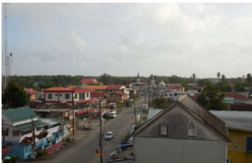
The main street in New Amsterdam, Guyana, where I will be living and working.

P.S. In addition to prayer, here are ways to support me financially.