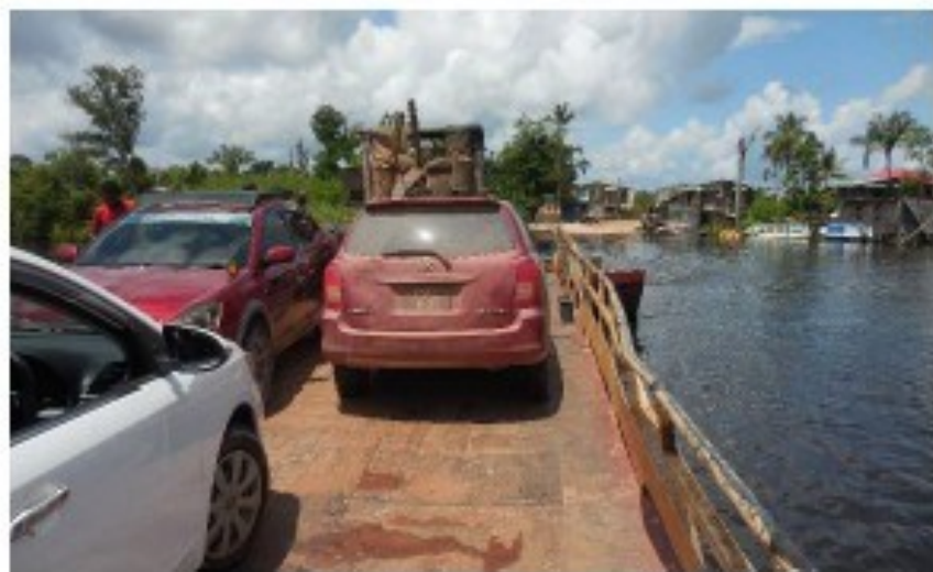
Crossing the river to Mt. Olivet Lutheran Church, Kwakwani. Ours is the white car, muddy after the dirt road.

One of the riverine congregations has adopted an ecumenical approach to ensure pastoral care for its members. Mt. Olivet Church, in Kwakwani, the furthest south of the Lutheran congregations, has become a Lutheran-Anglican-Catholic church, served alternately by visiting clergy and lay leaders from those three denominations. The members attend, no matter which liturgy they will be using that day.