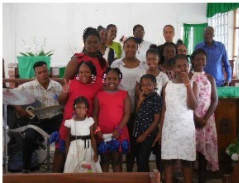
The congregation of Mt. Olivet

P.S. In addition to prayer, here are ways to support me financially.