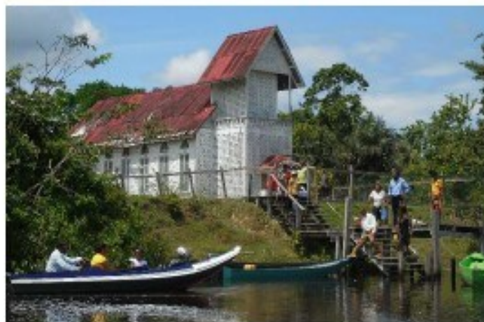
The congregation of Reformation Lutheran Church, Kimbia, going out to the "parking lot" after worship.

Greetings of peace from the risen Christ and from me as I serve on behalf of the Evangelical Lutheran Church in America in partnership with the Evangelical Lutheran Church in Guyana (ELCG). For most of you receiving this newsletter, these are the last days of summer, and you may be traveling home from a vacation or from visiting family elsewhere. I have been traveling, too, meeting my goal of