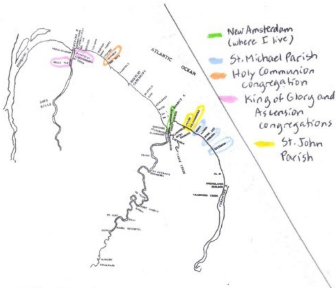
Location of Congregations and Preaching Points of the Lutheran Church in Guyana 1969.